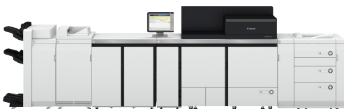
Configuration with Sensing Unit