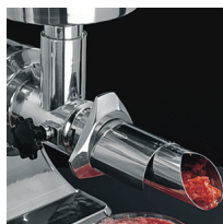
Tomato sauce making